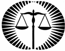
Social Action Ministry

Come, Come, whoever you are Wanderer, worshipper, lover of singing, Ours is no caravan of despair, Come join us in song.